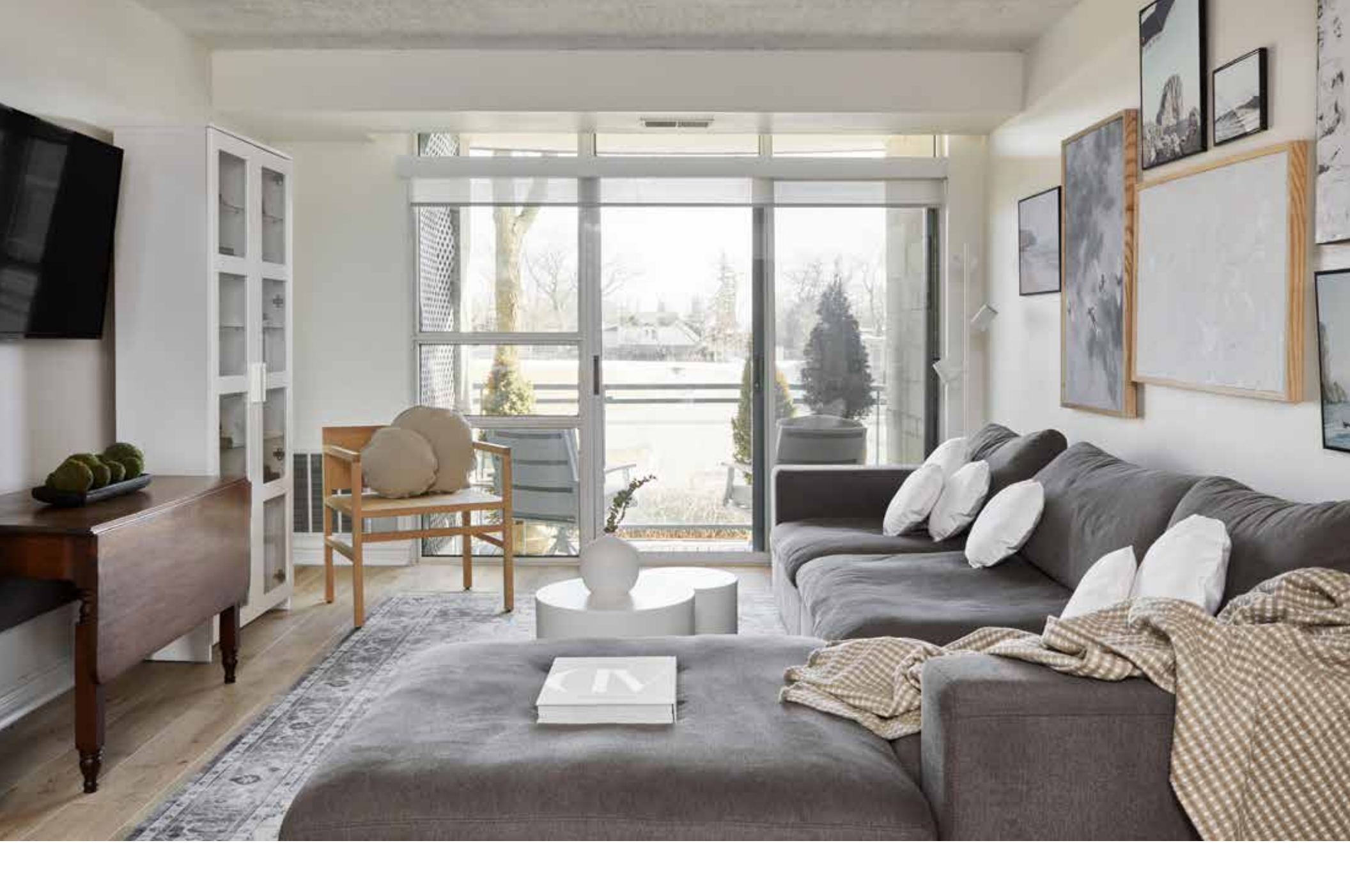
1093 KINGSTON ROAD, SUITE 102 HENLEY GARDENS